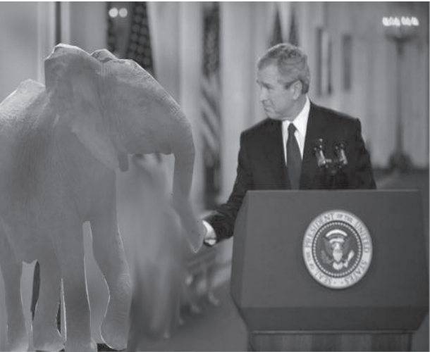
Bush is embarassed because he is shaking hands with an elephant

WASHINGTON, D.C. – Just yesterday, President George W. Bush nominated an elephant to fill the vacant spot in the Supreme Court left by Justice Sandra Day O’Connor. When asked about how he chose this elephant over the many other qualified nominees he replied, “Well, this elephant might not have gone to Harvard, or let alone speak English, but he really knows what’s up.” “This elephant lived in a zoo. He knows captivity first hand and will make sure that we secure the freedoms of our American people,” Bush continued. Also regarding the position of the elephant, Bush revealed he is a big supporter of animal rights. The democrats were very annoyed with Bush after this nomination. “Can he be any more blatant? Out of all the animals, he picks an elephant! And they don’t even speak English!” was the cry of one democrat.