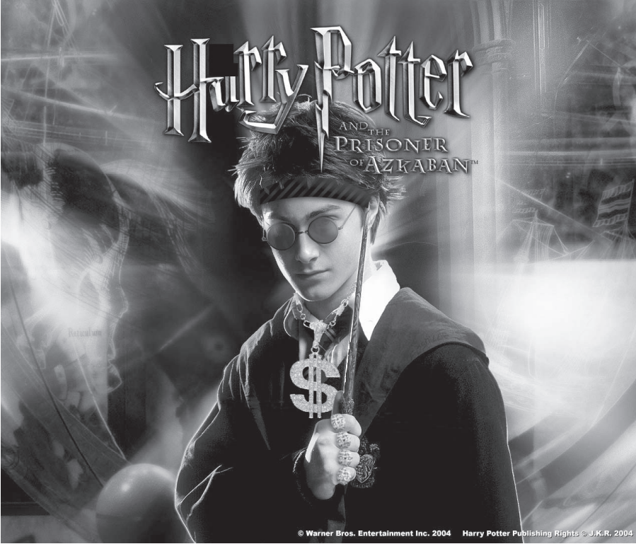
Hurry Potter decked out in his brand new bling

Through all the hype, Get Snitch or Die Tryin’ will be translated into a number of languages including, Norwegian, Canadian, Latin and Parseltongue. And with the future release of The (Sirius) Black Album , rumors have escalated quickly as to Sirius Black is in fact alive and living in Madagascar allegedly recording songs sounding somewhat like “Get Tough, Get Mad, Get Agascar”. Well, that’s all the news we here at the Siren have for now regarding the Half-Blood Gangsta. Have a good year.