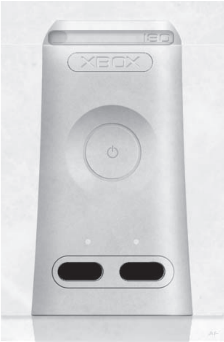
The new XBOX 180, only half as cool