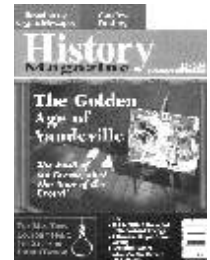
1849 History Magazine, still as current as ever

ANAPOLIS, MA—After scouring the lost pages of my favorite magazine, the renowned History Magazine , I found that the unbelievable 1849 November edition is as