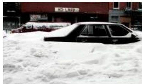
Think its a tough day for this car? How about School Chest?

With no students to consume the pizza and the various fruit juices and overpriced coffees, School Chest executives executed plan B. Nearly half of the student body received phone calls from DHS which solicited pizza sales. "As if it's not enough that they are constantly all up in my grill.