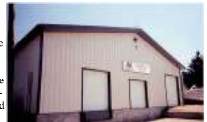
The Russians' Warehouse

With espionage and accusations at their highest, onlookers witnessed the expansion of territory, the creation