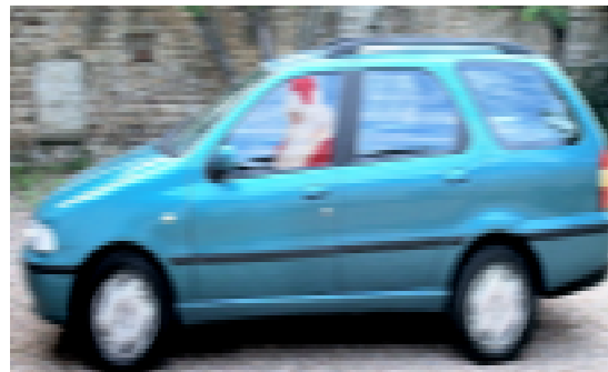
Santa, going at least 1000 over

Many children were disappointed at the lack of gifts under their tree. Santa works from east to west (benefit of time zones), so no gifts were delivered west of Chicago. One 7-year-old boy from Los Angeles told The Flipside, "It's a good day to be Jewish!"