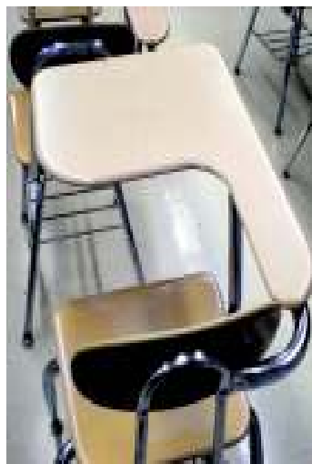
The classic Deerfield right-handed desk

Will justice be served? Well, that is up to the presiding judge. He explains, "I see where he is getting