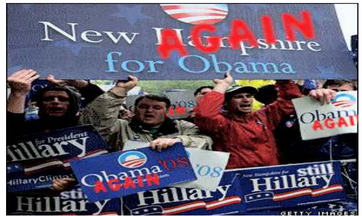
Active Obama and Hillary supporters getting involved for the second, or maybe even third time

"Why should we stop at just three?" asked former New York City Mayor Rudy Guiliani, who had a disappointing finish in the New Hampshire primary. "New Hampshire should have a quaternary and a quinary, or whatever you would call it, I have no idea. Everybody deserves a chance to rebound, like the American people did after 9/11."