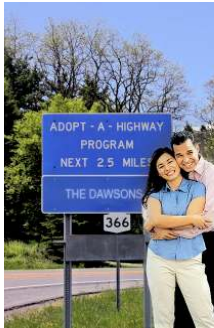
The Dawsons with their adopted highway

The adoption papers are still underway, but the Dawsons are very happy with their adopted highway. "So far, it's really all we hoped it