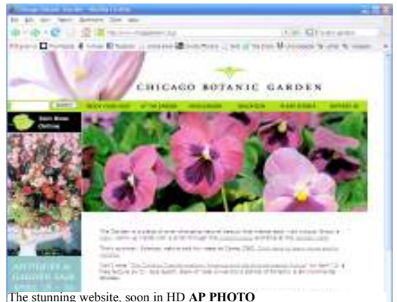
The stunning website, soon in HD