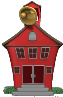
School Bell

Another beneficiary of the new Satan-bells is the