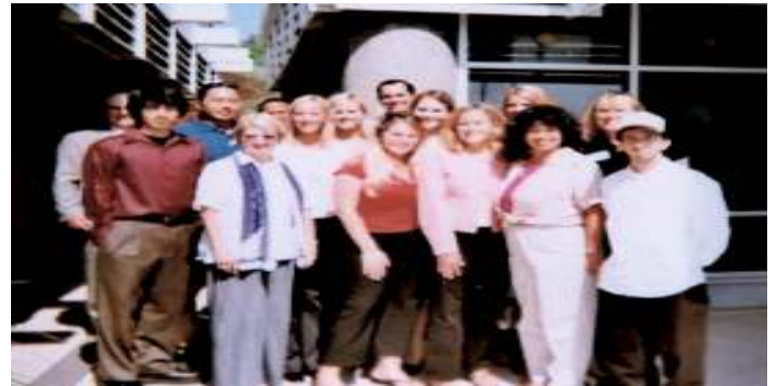
The Deerfield High School Student Council

This new effort by the Student Council hopes to harness its