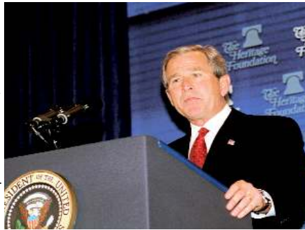
Left: President Bush urges Americans to support our Souljas, Right: The Soulja Boy

This may have been the President's most articulate speech of