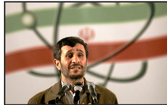
President Mahmoud Ahmadinejad

dumb enough to ask for details. "Why would we lie about something like that?"