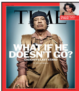
The cover that Gaddafi thinks portrays him negatively

Despite the United Nations Security Council imposing a no-flight zone on Libya, Gaddafi