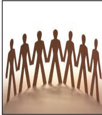
The Feminist Club meets to discuss and fix inequalities between males and females in society.

But Blake is one of a small but diverse group of heroes, drawn to the club for a variety of reasons like it's