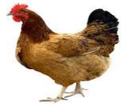
Egg prices in the Midwest increase; hens retire early (p.8)