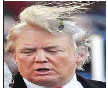
Trump's hair found to be fake; people lose trust in politicians (p.4)