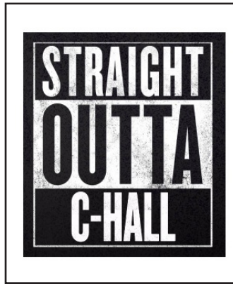
M.W.A.'s new album "Straight Outta C-Hall" drops February 29th, 2017.

M.W.A. also sees the release of the new album as retaliation in its ongoing feud with rival Deerfield rap group Jog-D.M.C., whose music focuses primarily on cardio exercises. M.W.A. claims it is seeking revenge for Jog-D.M.C.'s recent "walk-by" attack, in which group members hurled insults at M.W.A. before making an escape by speed-walking away. In response, M.W.A. have encouraged students to boycott walking to school and instead drive to school or ride the bus. Regarding the nature of the two rap groups' feud, a spokesperson for Jog-D.M.C. commented that "It's tricky."