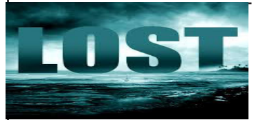
Student reported missing, found 6 days later having finished LOST on Netflix (p.9)