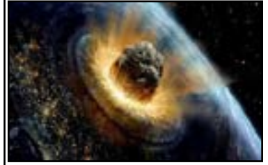
Student oversleeps finals, world hit by meteor (p. 6)