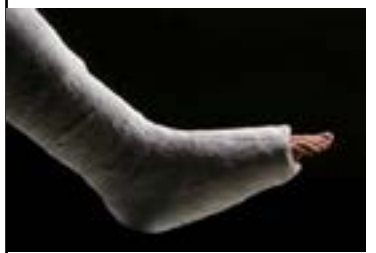
Fall play: Student breaks leg to get into the cast (p. 9)