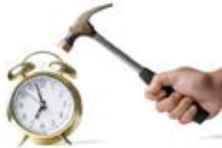
Students prepare their hammers to demolish new alarms for next year's late starts

Not everyone, however, was as enthusiastic about the schedule change. The spokesperson for Wednesday, dissenting, stated that "mid-week late starts are a cultural institution. What