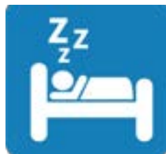
Sleep: the only thing that students will say they will do in abundance this summer, and actually will do in abundance this summer.

ally exotic place that other people would love to go to.