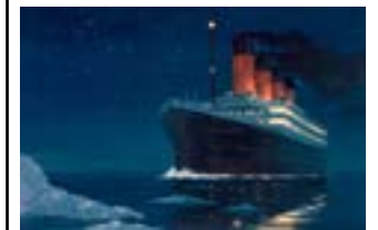
Senior boat trip interrupted by iceberg; Titanic 2.0 (p. 11)