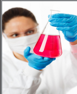
Junior emboldened to ask out crush since they have chemistry together Pg. 68