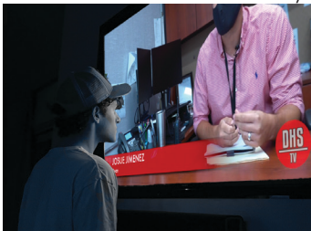
A DHS Student watches his mandatory detention messaging.

Stevenson, rivals with HPHS, not the other way around!” This, of course, is contrary to official DHS messaging which states “We have always been rivals with Stevenson, any thought to the contrary is untrue and must be discarded.” After his detention in Room 101 (previously D109), the student stated “I have no idea what I was thinking. My thoughts were treacherous, I realize now. I hope that one day I might be forgiven and be allowed to call myself a true follower of the Warrior Way.”