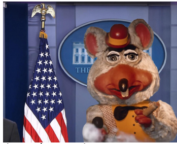
A new, better voice.

Midterms are just around the corner again, and House, Senate and gubernatorial elections are happening all across America. The Midterms have traditionally served as a reflection of the President's last two years in office, and these Midterms are no different. An America ever divided between the Democratic and Republican Parties will vote on the merit of their current congressman or congresswoman as well as their views on the President and his party. Republicans and Democrats have campaigned vigorously for the past year, especially in key battleground states. The two major parties hold a grip on American politics, often called the "Two Party System," yet one man—nay, a mouse—seems content to change that. Charles Entertainment Cheese, known by his internet persona "Chuck E. Cheese," is a third-party independent who aims to shake up these Midterms in a way we've never seen before. Charles runs on a "pro-pizza" platform and plans on making various reforms targeting American youth, including repealing and replacing