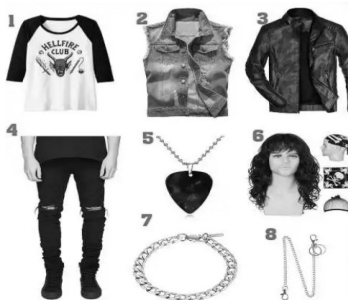
Eddie Munson from Stranger Things

If the other costumes haven't been quite to your taste, this one will surely take you straight to flavortown. Draw on a nice goatee, spike up those frosted tips (this is important), throw on a flame-patterned button-down and don't forget to sport some groovy shades to complete the look. If you want the gravitational forces of fried eggs and bacon to warp space and time, give this costume a go, and you'll be too hot to handle!